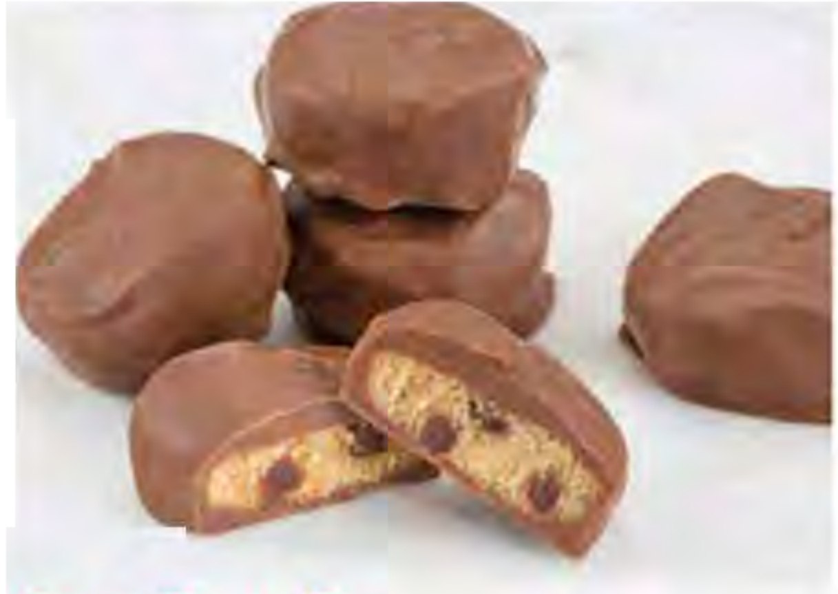
Cookie Dough Dots