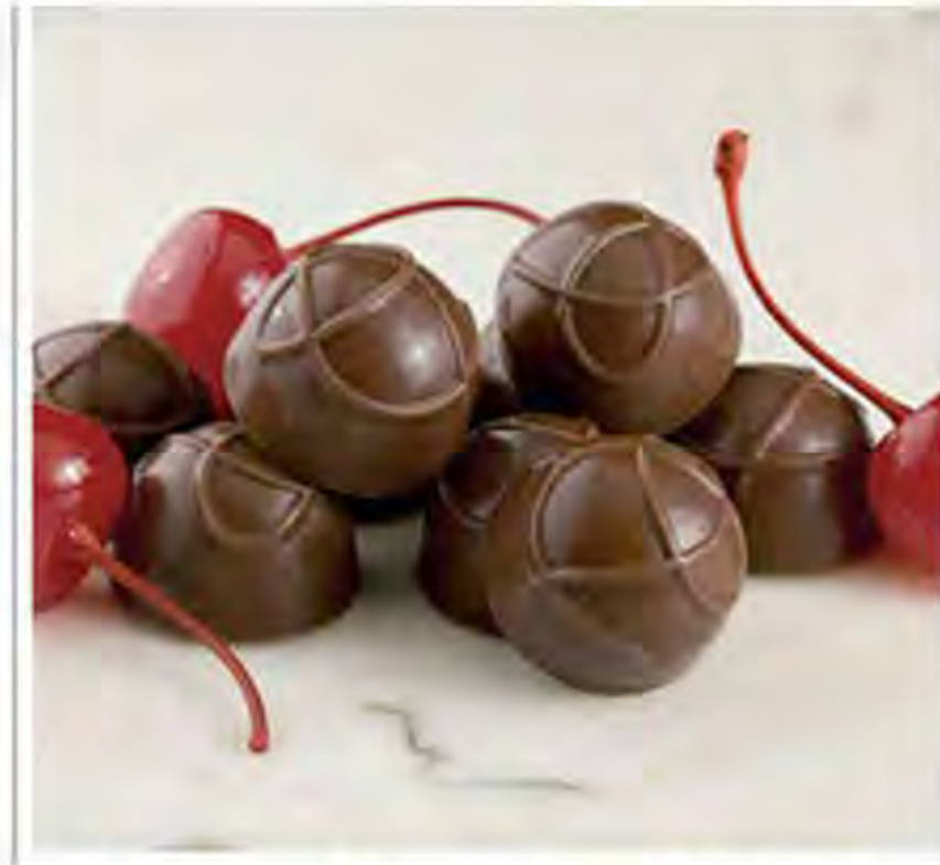
Milk Chocolate Cherry Cordials

INGREDIENTS: MILK CHOCOLATE (SUGAR, COCOA BUTTER, MILK, CHOCOLATE LIQUOR, SOY LECITHIN, NATURAL FLAVOR), CENTER (FONDANT (SUGAR, CORN SYRUP, WATER), HIGH FRUCTOSE CORN SYRUP, CITRIC ACID SOLUTION (CITRIC ACID, WATER), CHERRY FLAVOR (PROPYLENE GLYCOL, WATER, NATURAL FLAVORS), RED COLOR #40 BASE (WATER, RED #40), THINNING SYRUP (SUGAR, SORBITOL, HIGH FRUCTOSE CORN SYRUP, WATER, POTASSIUM SORBATE), POTASSIUM SORBATE)