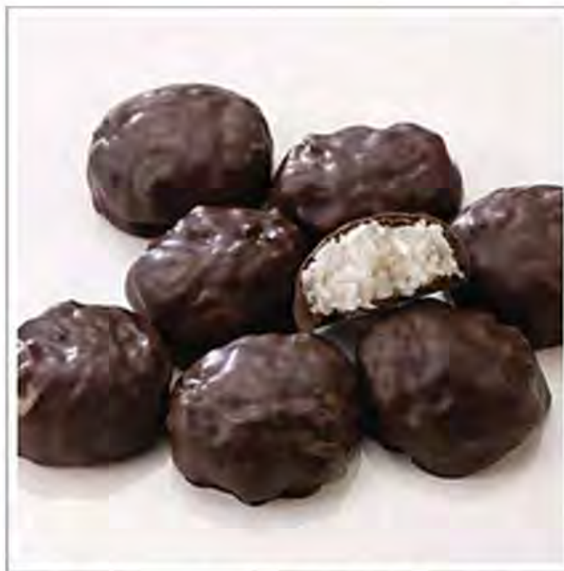
Dark Chocolate Coconut Tropical Dreams