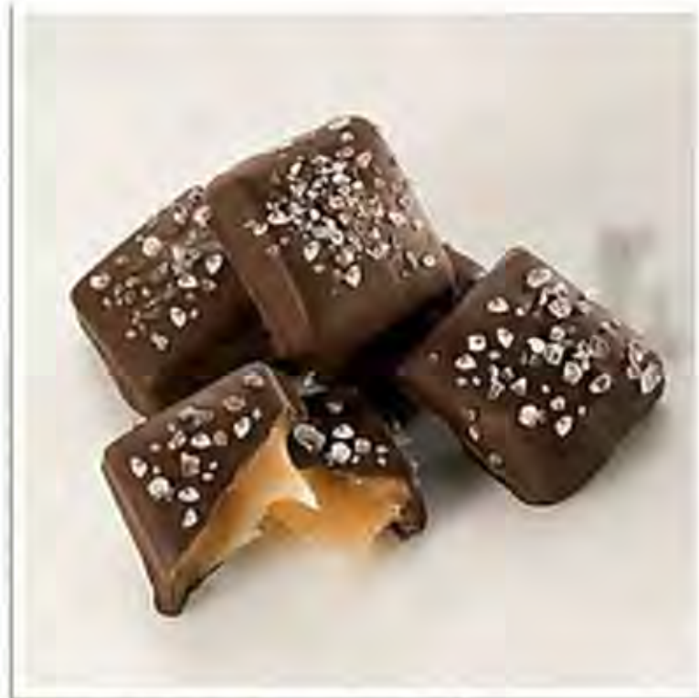
Dark Chocolate Sea Salt Caramels